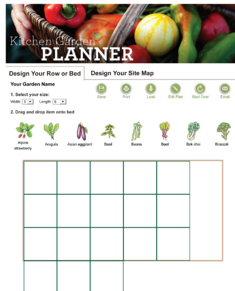
Screenshot from Gardener's Supply Company's free garden planning tool at www.gardeners.com