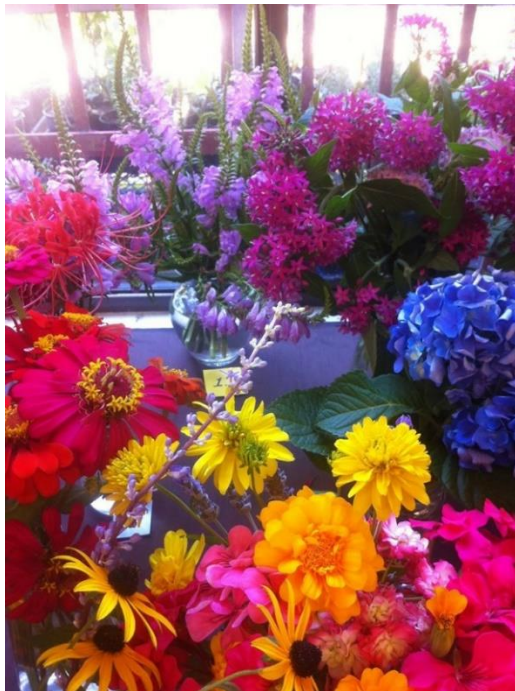
Coffs Harbour Garden Club meets at the Botanic Garden Display Room the third Saturday at 1:30pm.

We welcomed 54 clubs from Bathurst, Coonabarabran, Werris, Twin Towns, Hobart and many more to the Facebook 'Club Activities' and 'Your Garden Gossip' Groups with people from across Australia