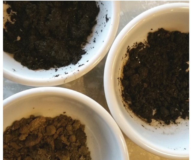
Examples of soil color and texture.